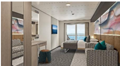
BALCONY STATEROOM (Category BA)