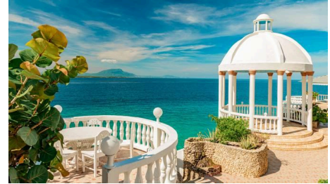
Puerto Plata, Dominican Republic

Sail on all-new Norwegian Aqua™, the latest evolution of their innovative Prima Class. Sail from sunny Miami to the Dominican Republic, where you can catch spectacular views at the top of Pico Isabel de Torres Mountain. Find natural treasures in St. Thomas and Tortola, home to pirate legends and amazing coastal cuisine. Then splash the day away at Great Stirrup Cay, Norwegian's very own private island where you can relax on the beach, grab a cocktail or even ride a zipline.