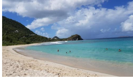
Tortola, British Virgin Islands