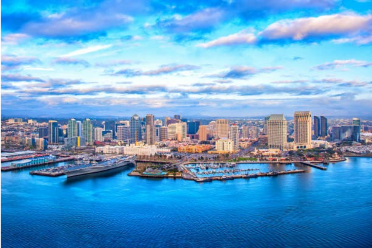
San Diego, California